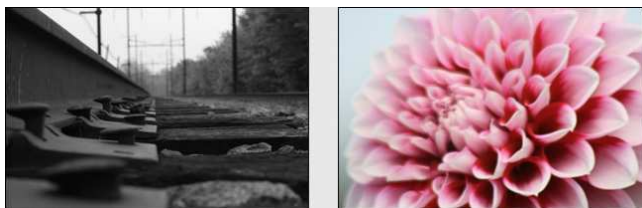
Two examples of Sam's work!

Visit mulberryartstudios.com for more information.